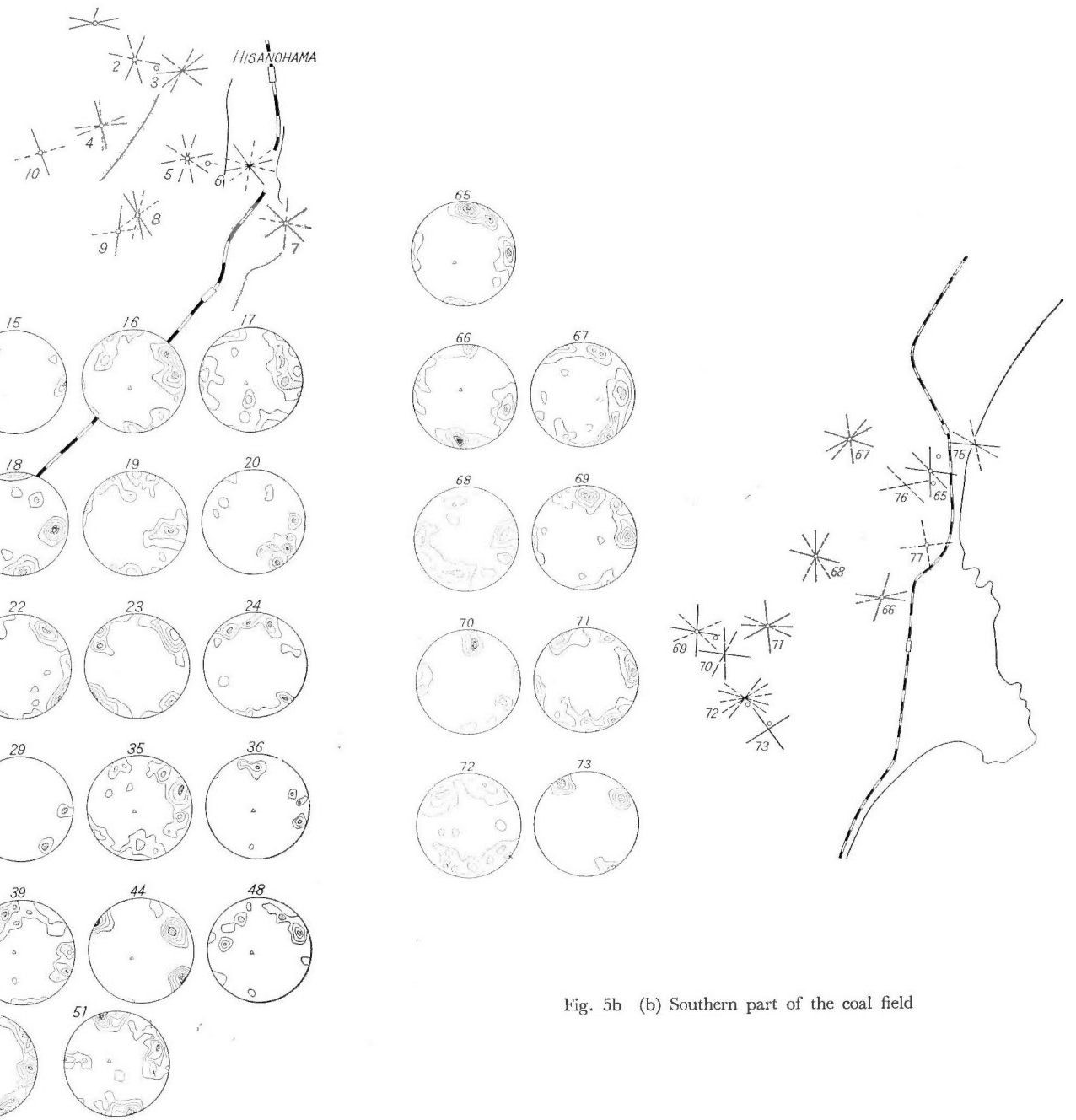
Fig. 5b (b) Southern part of the coal field